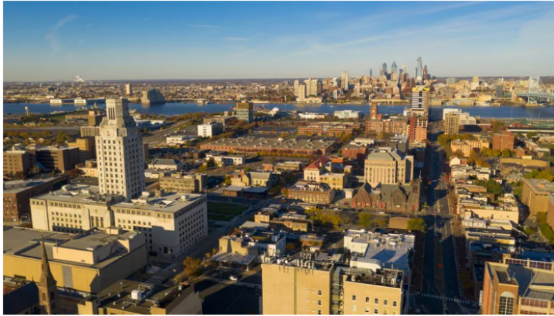
Aerial view of Camden, New Jersey